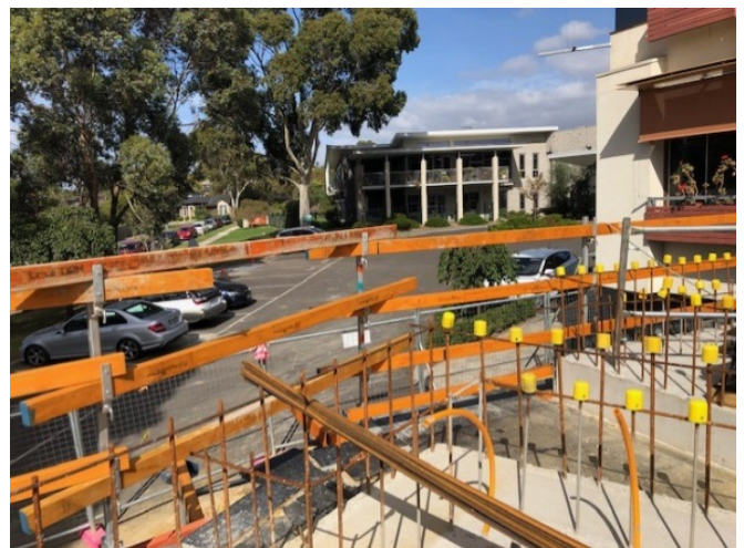
Above: Level 1 view across to O.L. Wing from the balcony