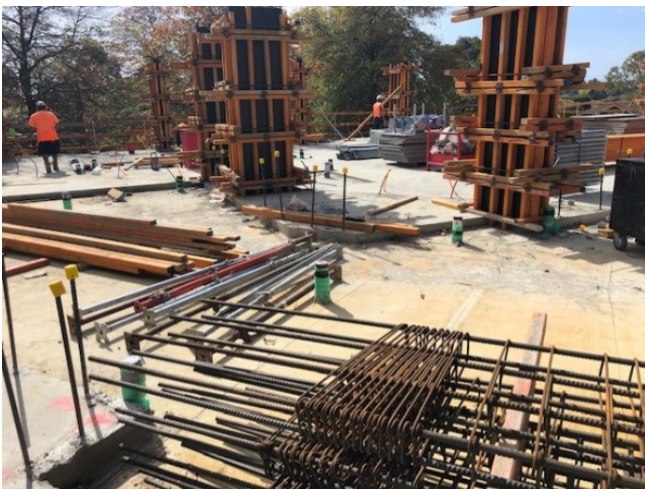
Above: Preparation of the level 2 columns

Most of the precast panels to level 1 will be installed over the next few weeks and the bulk of the work will be focussed on preparing for the pour of the level 2 slab.