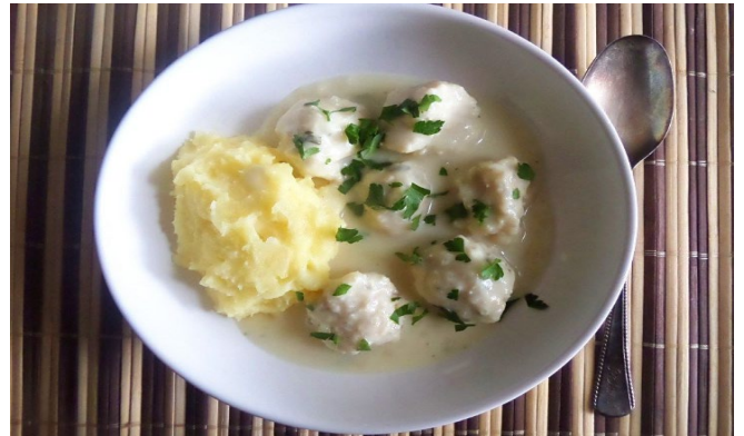
Königsberger Klopse with parsnip mash & beans

The Café is another great place to meet with family and loved ones. It has been a great hit with our residents who come and enjoy some home-made German style cakes as well as a delicious coffee. Hopefully we will see you soon.