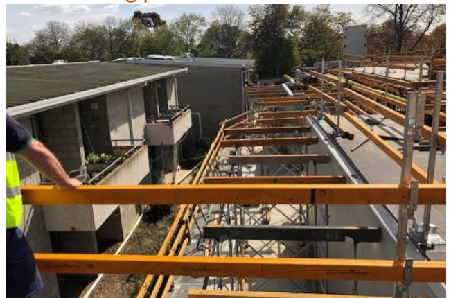
Above: Looking between the new build and Altersheim from the level 2 area

The official completion date for the main building has now moved to the 27/01/2020 with the final completion now the 21/05/2020. The building company are however endeavouring to still complete the new building prior to Christmas.