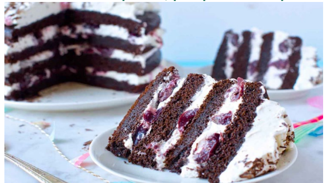
Black Forest Cake