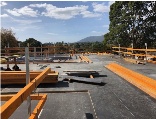
Above: Level 2 slab preparation works

We would like to take the opportunity to bring you up-to-date with the current state of the building works. The columns over the administration area are already in place and the boxing out of the support and shape of the level 2 slab are well on the way.