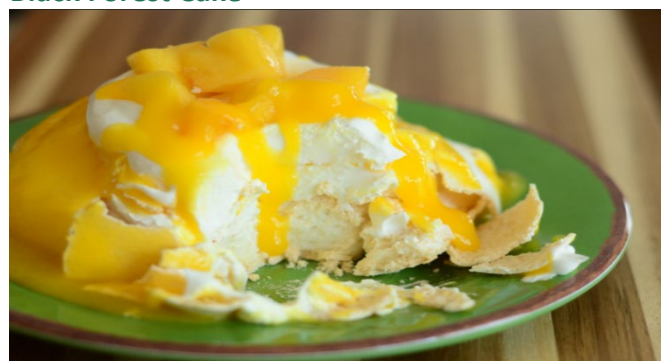
Pavlova, mango coulis with whipped cream