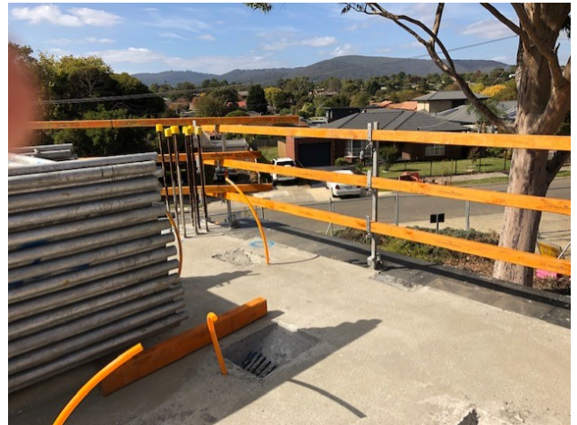
Above: eastern bedroom view

The official completion date for the main building has now moved to the 27/01/2020 with the final completion now the 21/05/2020. The building company are however endeavouring to still complete the new building prior to Christmas.