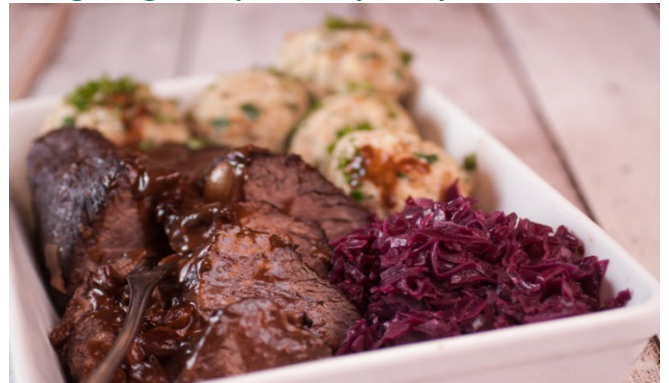
Sauerbraten with potato, pumpkin & turnips