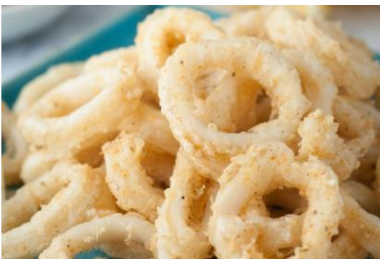
Dukkha spiced fried calamari, fresh coleslaw & sweet potato chips

Summer is here and our kitchen has been busily preparing some delicious new dishes for our summer menu. We're keeping the favourites, while adding new seasonal dishes to enjoy. Here's a taste of what we are highlighting this season: