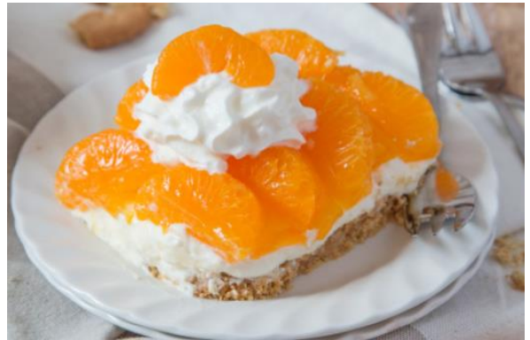
Mandarin baked cheesecake served with whipped cream