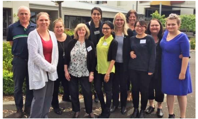
Birch Pathway Leadership Team

In August 2018, TTHA in partnership with Dementia Australia started the Birch Pathway, with the aim of working towards a sustainable, exemplary person-centred care for our residents. Since then, we have put together the Birch leadership team consisting of staff from all areas of the home. The leadership team have so far had two meetings and begun their projects around purposeful lifestyle activities, dining room experience and building relationships through communication. The group is excited and are seeking valuable advice and feedback from all residents, representatives and their colleagues about how we can achieve these projects.