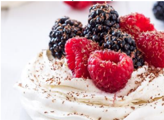
Mixed berries & cream served with a meringue