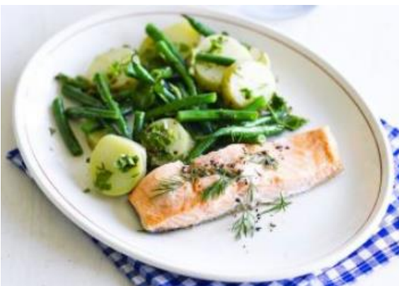
Paprika dusted salmon, traditional German potato salad, asparagus & hollandaise sauce