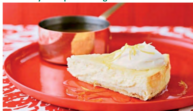
Baked Lemon Cheesecake and whipped cream