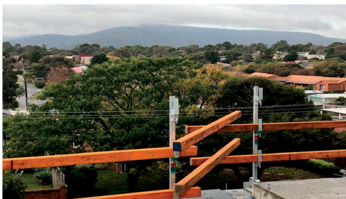
View from the top of level 2

Each of the two accommodation levels have a large dining room and lounge room. Level 1 dining room opens up onto a large balcony that will be equipped with outdoor tables and chairs. This balcony also has an electric louvered roof for rain protection. Level 2 has a smaller balcony for outdoor sitting. These dining and lounge rooms will service both the new building and the connecting Warrina rooms.