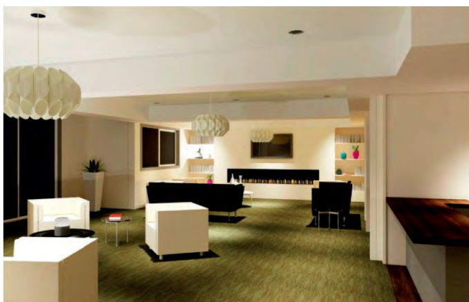
Typical Lounge Room

Each accommodation level will have a 'warming kitchen'. The existing main kitchen will continue to prepare all meals that will be transported to the warming kitchens in heated 'pods' and transferred directly into built-in bain-maries. Adjacent to the dining rooms are the nurses stations and are open fronted (as seen at the rear of the above Dining Room picture). These nursing stations will service both the new building and the connecting Warrina rooms.