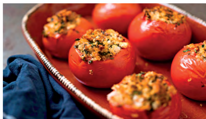
Stuffed tomatoes with beef mince & fresh herbs