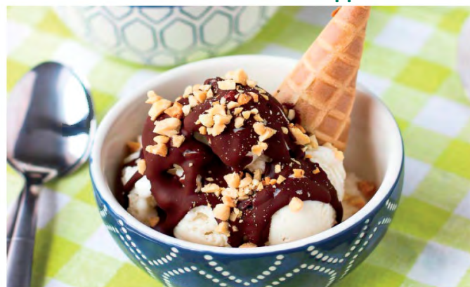
Ice cream sundae with peanuts, topping and a waffle stick