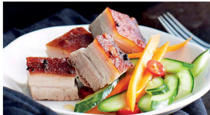
Pork belly with pickled vegetables & rice