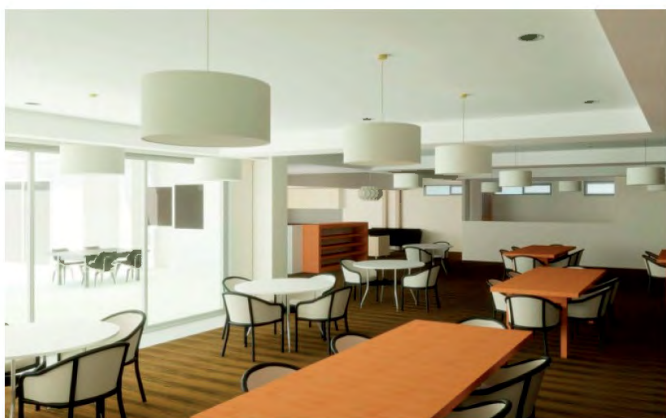
Typical Dining Room

Each of the two accommodation levels have a large dining room and lounge room. Level 1 dining room opens up onto a large balcony that will be equipped with outdoor tables and chairs. This balcony also has an electric louvered roof for rain protection. Level 2 has a smaller balcony for outdoor sitting. These dining and lounge rooms will service both the new building and the connecting Warrina rooms.