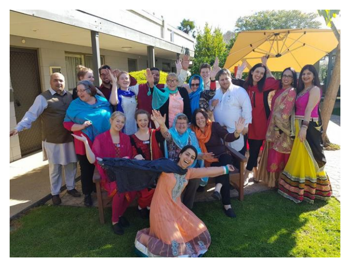
Indian Cultural Day

On the 14<sup>th</sup> of August, we held our annual Indian Cultural Day. With traditional Indian food and music, our residents enjoyed the entertainment whilst some joined in the dance.